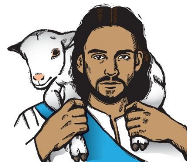
The Parable of the Lost Sheep